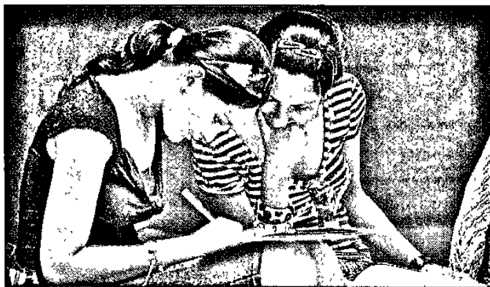
MORE OPTIONS TO CHOOSE FROM

The AG cited stringent conditions of seeking the approval of the UGC and the RBI in setting off-campus centres